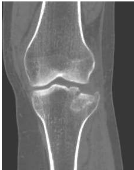
Side, sagittal, view of the same fracture