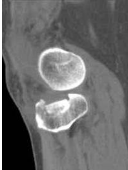
Front view of laterally compressed fracture

A Coronal and Sagittal CT Scan images of a Tibial Plateau Fracture (Below): This reconstructed image (made of many images reformatted by the computer) shows a lateral compression fracture through the lateral tibial plateau. The goal of treatment is to restore the height of the depressed fragment seen here.