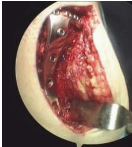
Side view of the plate in place