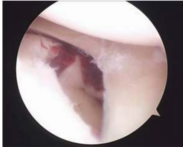
Arthroscopic view of the same fracture

Note how the depressed tibial plateau is no longer supporting the lateral meniscus. This explains the lateral knee instability.