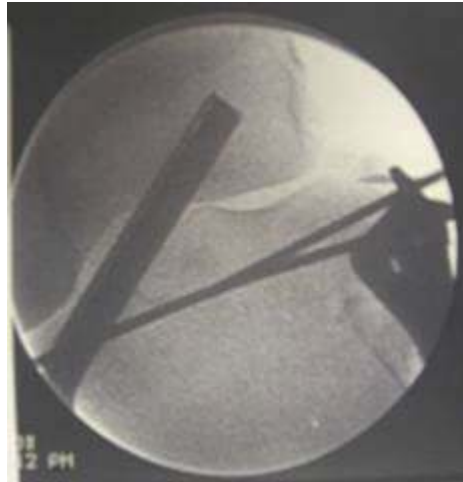
Intra-operative X-ray of the scope in place and a trial positioning of the plate with the bone elevated to its normal height.