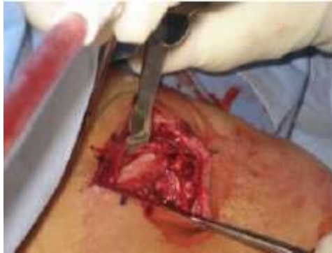
Figure 4: Surgical Approach