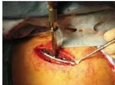
Figure 10: Screws being placed