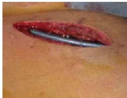
Figure 13: Plate in place with screws

After the repair most patients are much more comfortable than before the broken bones are stabilized by the plate. A sling is used for to protect the arm after the surgery and although the bone is held in place by the plate the bone does not heal for some time. You can start to use the hand for simple activities but not for lifting, pushing (sorry no pushups) or pulling for 3-4 months.