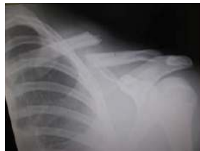
Figure 3: Simple right clavicle fracture with shortening