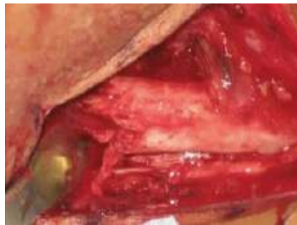
Figure 6: Lateral fracture fragment