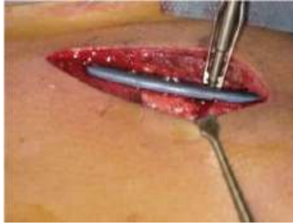
Figure 12: Tightening screws