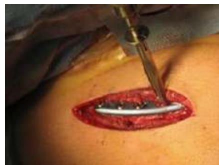
Figure 11: Screws being placed