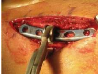
Figure 8: Plate in position