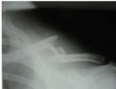
Figure 1: Comminuted fracture of the left clavicle

The images cannot be reproduced or modified for any use without specific written permission in advance. All rights are reserved.