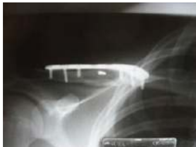
Figure 2: X-ray of a right clavicle fracture reduced with plate