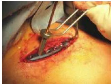
Figure 9: Holes being drilled