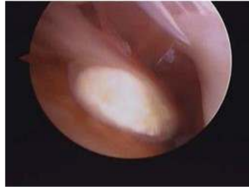
Fig 2: An inside view of a torn biceps tendon. See the torn end facing the camera head on.