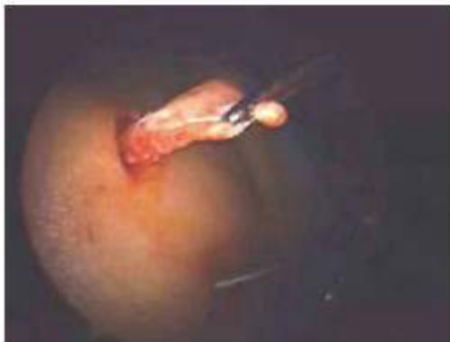
Fig 3: The tendon delivered out of a small incision.