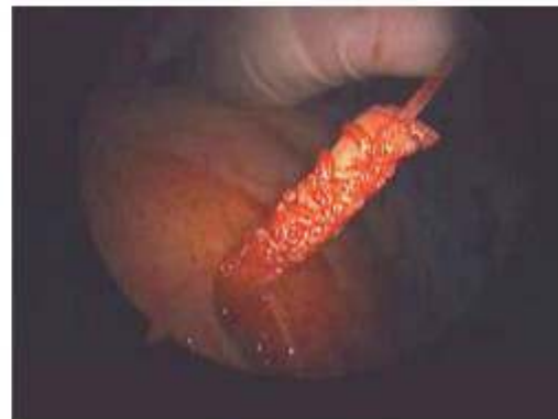
Fig 4: Sutures placed for the repair.