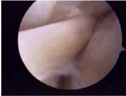
Fig 1: An Intra-articular view (inside the ball and socket of the shoulder) of a normal biceps tendon.