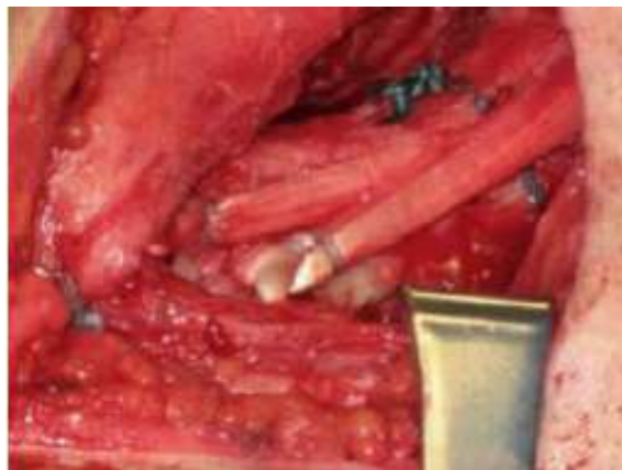
Figure 18: Closure: Deltoid- Trapezius Muscle repair.