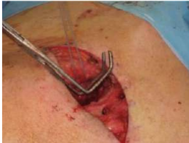
Figure 7: The guide sutures are passed prior to passing the graft.

Figure 6: A special clamp, the Stedinsky Clamp (often used in open heart surgery) is used to pass the sutures around the coracoid process. These sutures aid in passing the actual tendon graft that has been prepared separately on the OR table for graft placement later in the procedure.