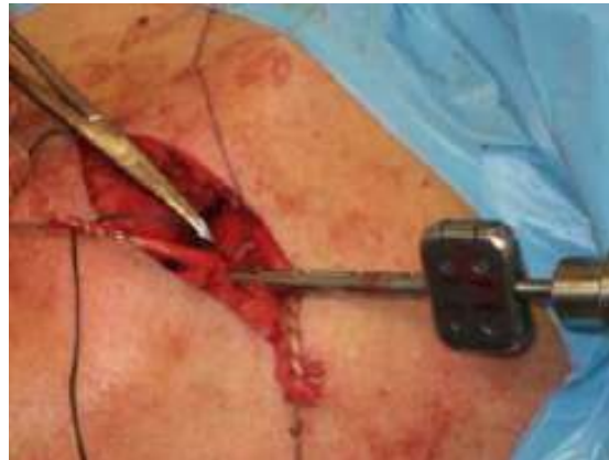
Figure 13: The screw is seated flush to bone.