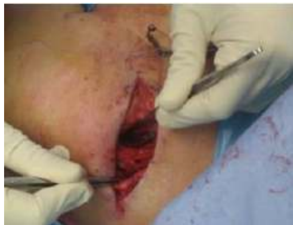
Figure 5: The holes have been drilled in the distal collar bone for the placement of the tendon graft after replacing the acromioclavicular ligaments in their natural position around the coracoid process (not seen here) of the scapula (shoulder blade).