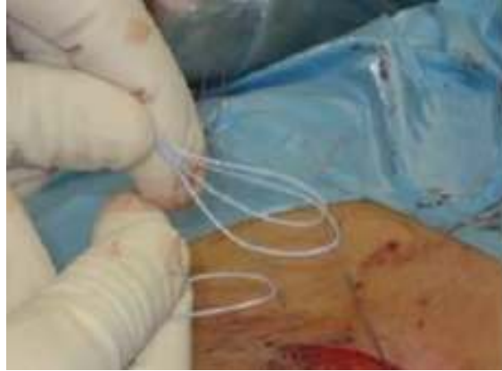
Figure 9: These loops are then passed under the coracoid process.

Figure 8: The suture loops that are attached to the leading ends of the graft are passed through the guide sutures.