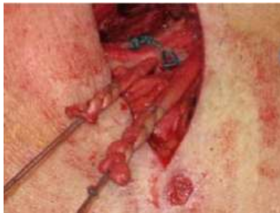
Figure 16: Positioned toward the AC joint.

Figure 15: Close up of the grafts passing out of the drill holes.