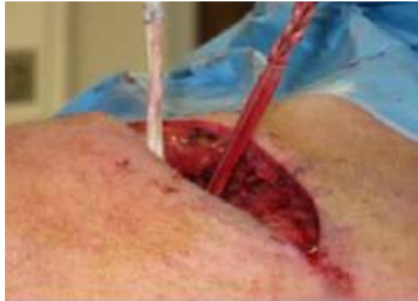
Figure 12: The graft is fixed in place with special screws with mechanical properties similar to natural bone.