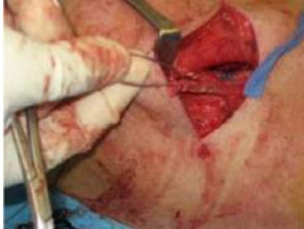
Figure 15: Close up of the grafts passing out of the drill holes.

Figure 14: Once the coraco-clavicular ligament grafts are set and secure, the graft ends are tensioned and pulled laterally to repair the ligaments between the acromion and the clavicle.