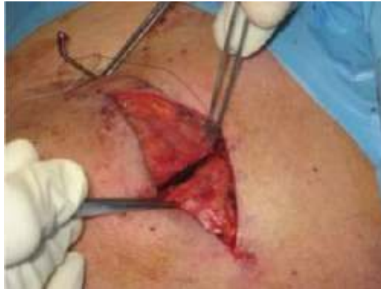
Figure 4: Seeing the edge of the unstable bone.