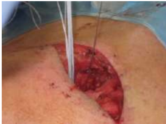
Figure 10: The graft follows the loops under the tip of the coracoid process.

Figure 9: These loops are then passed under the coracoid process.