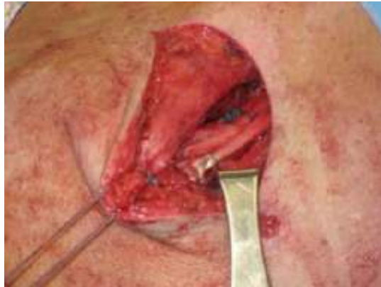
Figure 17A: Close up of complete four ligament repair.