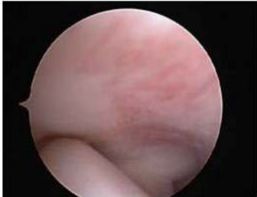
Figure 1: Inflamed RTC