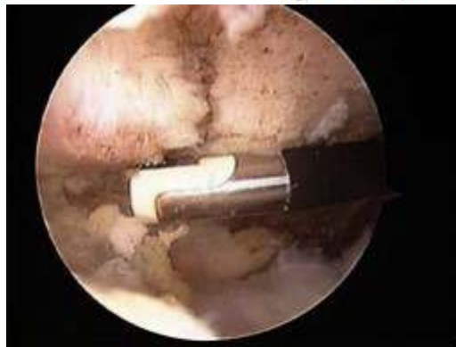
Figure 3: Abnormal AC Joint

Loss of use of the arm, pain with activity, loss of sleep or waking from sleep are common concerns with this condition and often the pain with activities of daily living (taking milk out of the refrigerator, washing your hair or putting a coat on) cause patients to seek care. The complete inability to sleep a full night can worsen and prompt treatment.