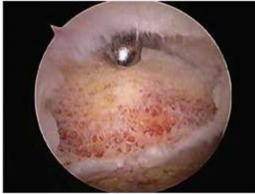
Figure 5: Smoothing the Distal Clavicle