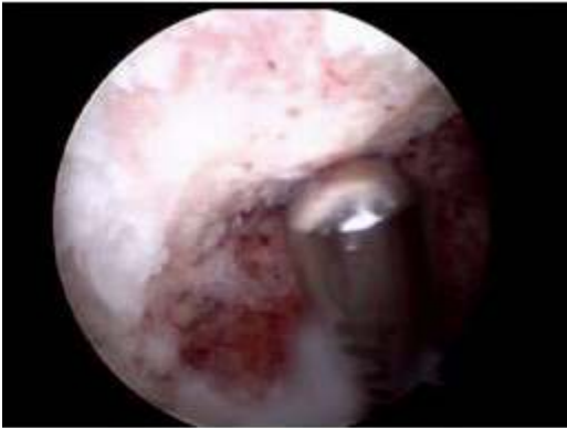
Figure 4: Spur Removal